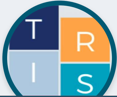
Trauma- and Resilience Informed Systems Training from Trauma Transformed