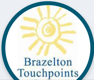
Brazelton Touchpoints Center