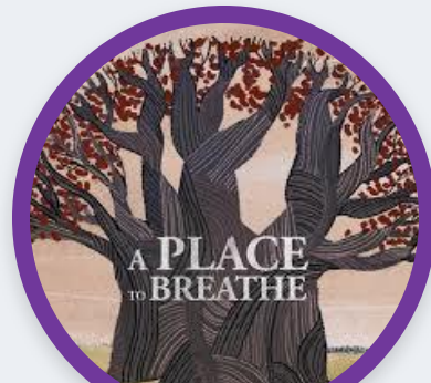
A Place to Breathe