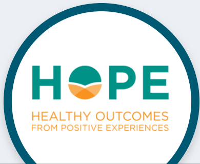
Healthy Outcomes from Positive Experiences (HOPE)