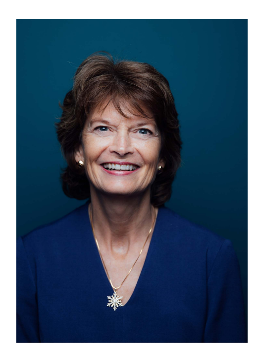
Lisa Murkowski, U.S Senator (R-Alaska)